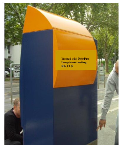
Treated with NewPro Long-term coating RK CCS

another ticket machine. Treated with NewPro Long-term coating RK CCS