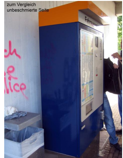
zum Vergleich unbeschmierte Seite

Graffiti smearing with 2-component lacquers and underbody protection