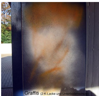
Graffiti (2-K-Lacke und Unterbodenschutz)