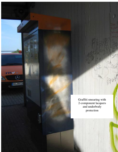
Graffiti smearing with 2-component lacquers and underbody protection