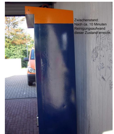
Zwischenstand: Nach ca. 10 Minuten Reinigungsaufwand dieser Zustand erreicht.

Interim cleaning status after approx. 10 minutes cleaning effort